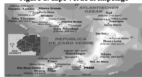
Figure 1: Cape Verde archipelago