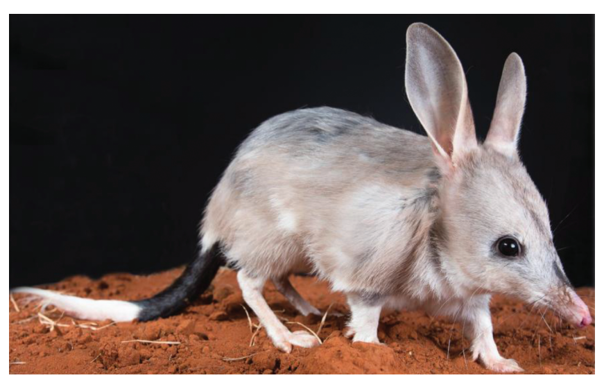
Figure 2 The greater bilby ( Macrotis lagotis ), a nocturnal marsupial endemic to Australia

Chocolate makers explored this opportunity to reposition their products and appeal to different customer segments by adopting a co-branding strategy, when two brand names of different companies are used on the same product or service.