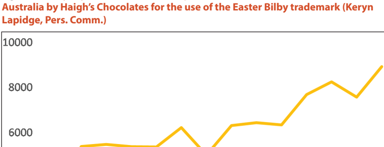
Figure 5 Yearly royalties, in 1996 AUS$, paid to the Foundation for Rabbit-Free

While the results suggest the customer-based brand equity of the Easter Bilby is declining, it is also important to look at how the brand is performing in term of financial brand equity (Lassar et al., 1995). I did this by looking at how royalties for the Easter Bilby trademark have varied from 1996 to 2009, the dataset available (see Figure 5).