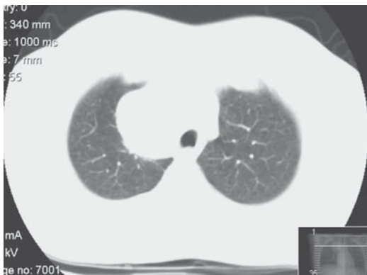
Fig. 3 – Thoracic computed tomography scan showing a paratracheal and pre-tracheal mediastinal mass, well-defined and with hydric content attenuation values

Sandra Saleiro, Adriana Magalhães, Conceição Souto Moura, Venceslau Hespanhol