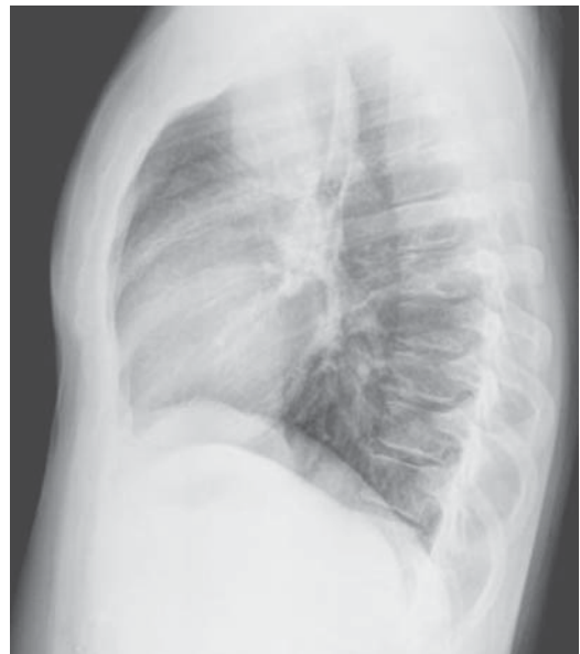
Figs. 1 and 2 – Chest radiograph showing a right-sided opacity in the anterior mediastinum

exam of his was inconclusive, revealing only mature B and T lymphocytes.