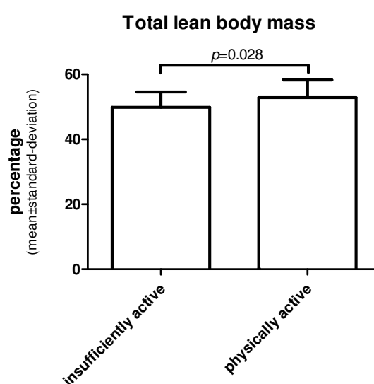
Figure 1. Percentages of total lean body mass of women who were insufficiently active and physically active

Figures 1, 2 and 3 represent the comparison of the average percentages of total body, leg and arm lean mass, respectively, between women who were physically active and insufficiently active. Physically active women showed significantly higher mean values for total lean body mass ( 52.8 \pm 5.4 vs 49.8 \pm 4.7 ; p = 0.028 ) and leg lean mass ( 17.1 \pm 2.2 vs 15.9 \pm 1.8 ; p = 0.026 ), whereas the difference in arm lean mass was not significant ( 5.9 \pm 0.8 vs 5.5 \pm 0.8 ; p = 0.082 ).