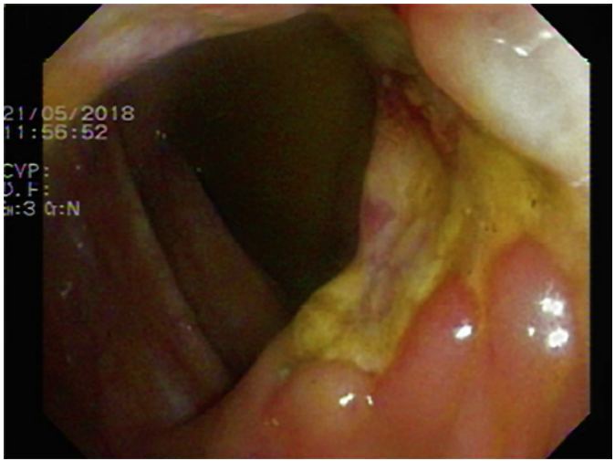
Fig. 2. Hepatic flexure lesion.