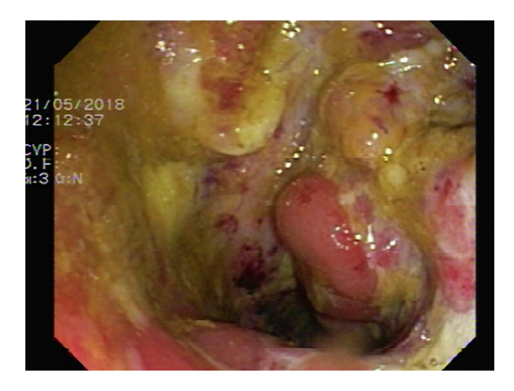
Fig. 1. Rectal lesion resembling a tumour.

To identify CMV colitis, colonoscopy is preferred over flexible sigmoidoscopy, as more than one third of affected patients have gross disease restricted to proximal regions of the colon. Furthermore, it is also important to