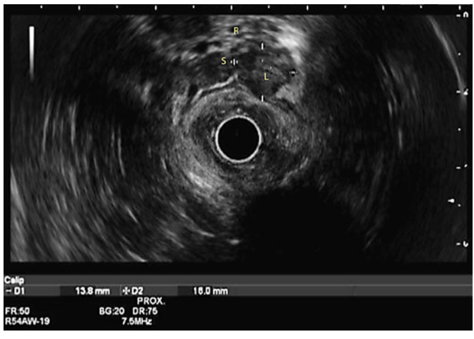
Fig. 3. Radial endoscopic ultrasonography imaging at 1 h showing the homogenous hypoechogenic lesion previously characterized located in the recto-vaginal septum (extrinsic to the wall of the rectum), although without a clear cleavage plane with the rectum muscular layer. L, lesion: R, rectum; S, recto-vaginal septum.

Extensive evaluation including brain magnetic resonance imaging excluded signs of carcinomatous meningitis. The final diagnosis was metastatic squamous cell anal carcinoma and idiopathic hypertrophic cranial pachymeningitis cortico-responsive of probable fibrocicatricial nature. In fact, to date, there have been no other reports of an association of these two diagnoses.