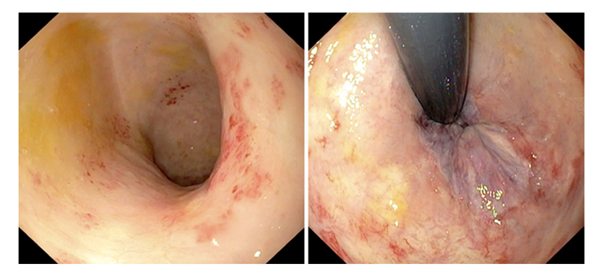
Fig. 3. Follow-up sigmoidoscopy, 3 months after RFA therapy, showing a healed rectal mucosa, with sparse telangiectasias, with no friability or bleeding.

no complications were recorded. Following the procedure, no further rectal bleeding occurred; the patient was discharged and resumed chemotherapy 1 month later. Endoscopic re-evaluation, 3 months after RFA, revealed sparse telangiectasias with no friability or bleeding (Fig. 3). At 6 months of follow-up, the patient maintained no rectal bleeding, stable hemoglobin (mean: 10 g/dL) and no further need for blood transfusions.