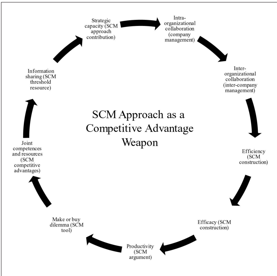
SCM approach as a competitive advantage weapon (resulting from Proposal 2)