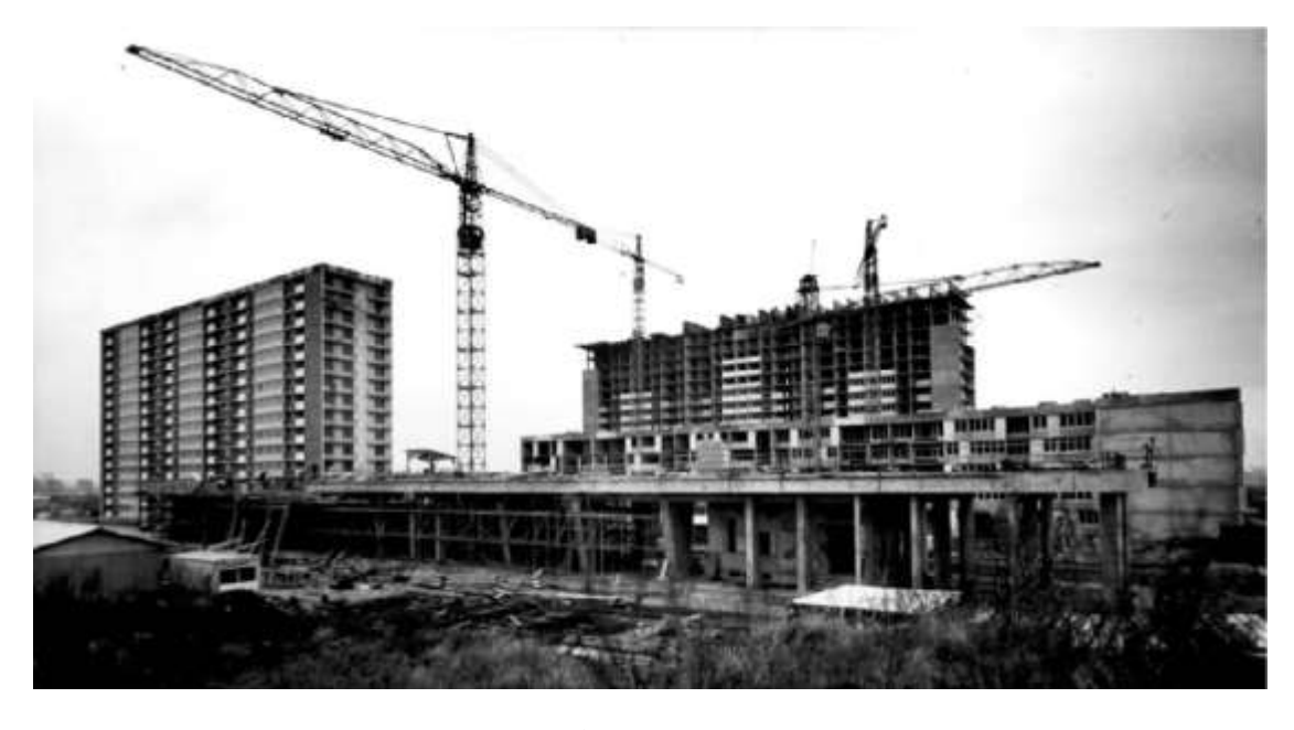
Figure 2. Cité Balzac building site in late 1960's

The characteristic achievements of the interwar HBMs were severely criticised by the modernists and the generations that followed, finding a certain rehabilitation in our days, praising their scale, more compatible with the traditional French cities. Le Corbusier (1887-1965) was one of the critics of this model of living, calling the buildings "sordid ante-chambers of the city"; his fellow countryman, the poet Blaise Cendrars (1887-1961) also vociferated against the way of life inside today's valued HBM flats. Part of the criticism focused on the ineffectiveness of public production from the achievements of that moment, either HBM or garden city; both models would be unable to face the growing housing deficit, especially after the destructions of the World War II. Large-scale housing production based on industrialized construction would emerge from the 1950s as the only possible answer to face the problem, replacing the HBM-type brick buildings as a design paradigm, loaded with ornamental details characteristic of artistic masonry.