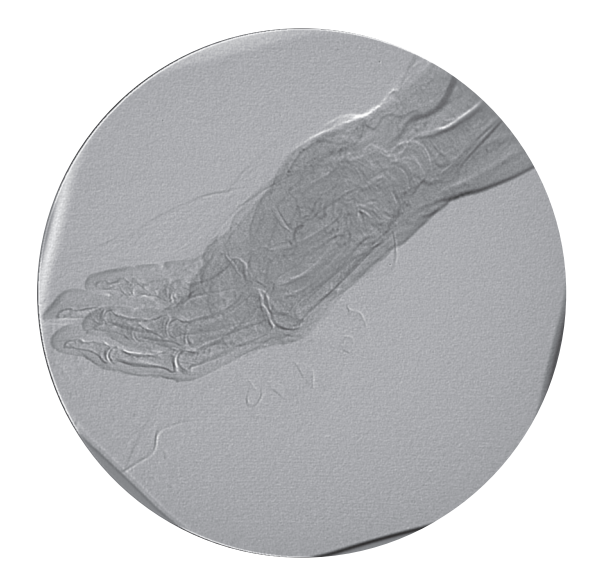
Figure 1 Initial intraoperative angiogram, showing the occlusion of the superficial palmar arch.

We do not really know the chain of events which ultimately led to what we believe was an intrarterial drug injection. The