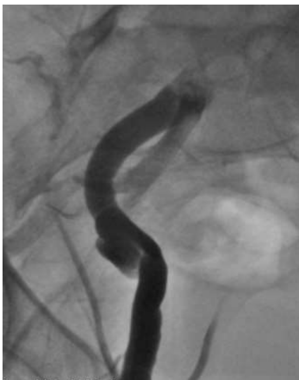
Figure 2 Initial angiography.

Evaluation of lumbar spine displayed slight degenerative changes. After retrograde right femoral puncture (6F), angioplasty with 9x40mm Complete® self-expandable stent was performed (Fig. 2 and 3).