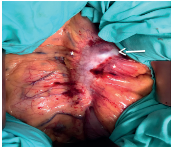
Fig. 3 Intraoperative image of an IAAA. It is notorious the bowel adhesion to the periaortic wall (stars). In the IAAA there is a retroperitoneal inflammatory reaction, with a shiny, white periaortic and retroperitoneal tissue (arrow).