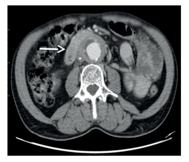
Fig. 2 In the IAAA there is inflammatory adhesions and the fibrosis to the adjacent structures. Note in the adhesion of duodenum (arrow) and the vena cava (star) to the aneurysm wall.