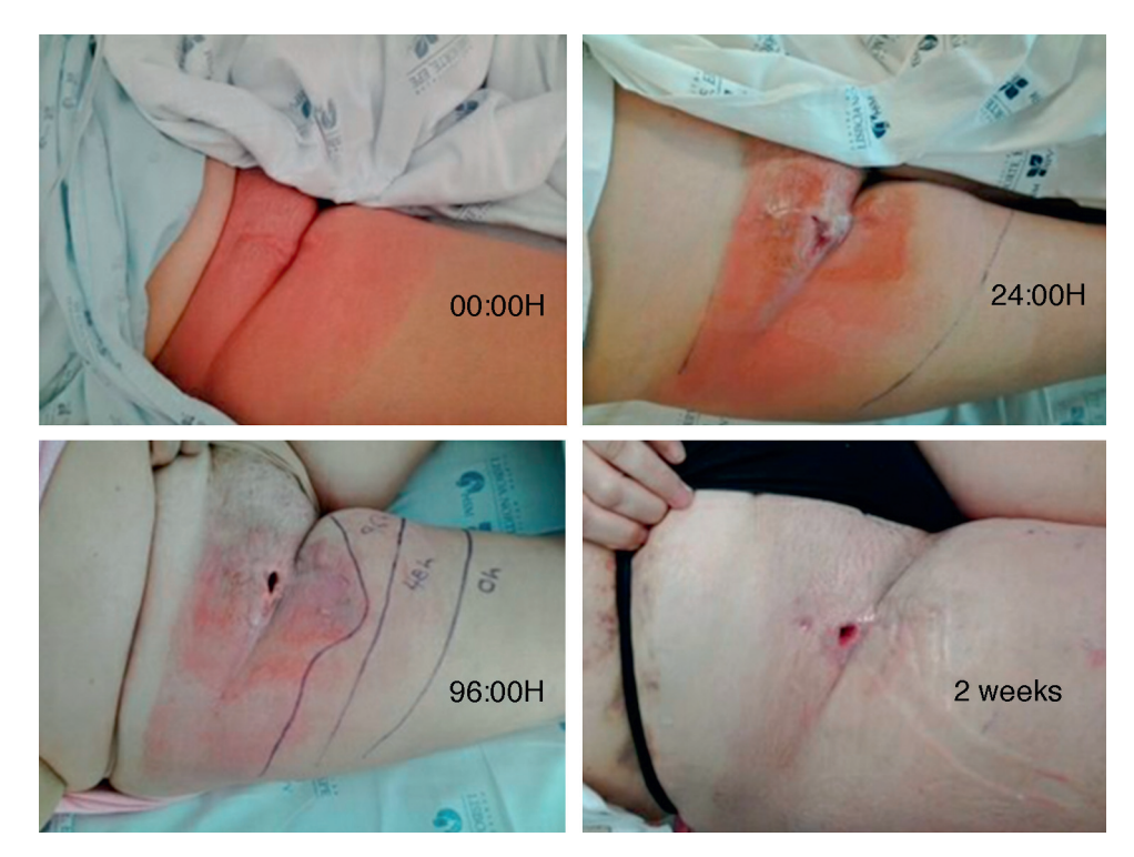
Figure 2 Evolution of groin infection.